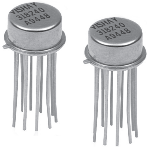
Product may not be to scale

The eight pin TO-5 package with 0.230" pin circle is an alternative layout to Model 1413. This network can contain up to 12, V5X5 resistor chips.